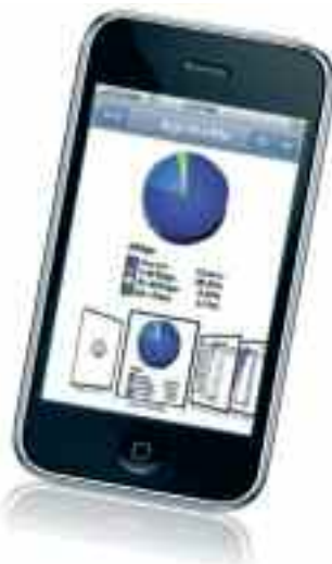
QlikView for iPhone

Evaluating QlikView is risk-free. Developing your QlikView applications is also free. Anyone can simply download QlikView from QlikTech's website ( www.qlikview.com ) and start developing applications with their own data. A fully-functional first application can be up and running in just a matter of hours. In fact, most customers are live with their first project in less than 30 days. And when you are ready to share your application with your colleagues or friends, let us know. We can provide a secure, shared infrastructure for you to demo your application to your group.