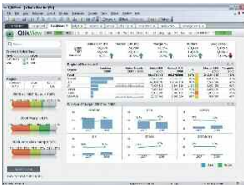
Visually Interactive User Interface

QlikView meets the critical need its users have to analyse, question and slice business data, and get the results out to decision makers rapidly. Unlike traditional BI solutions that make users adapt to their interface and methodologies, QlikView adapts to its user needs across the board. It enables users to be curious and creative on their own terms. It supports true collaboration and allows users to find and share analysis and in-sight with just a few clicks. Applications, reports and graphs can also be personalised for specific needs and distributed between user groups through QlikView Server. QlikView eliminates traditional BI's ongoing issue of creating islands of knowledge with multiple versions of the truth. In contrast, QlikView users collaborate from within a single version of the truth, sharing new mutually beneficial insights.